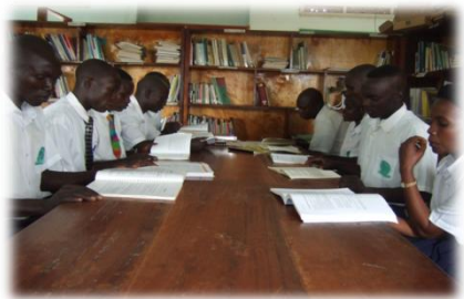
IPASC Diploma Course Students

The Diploma Programme, a 4 year course, is comprised of 3 orientations: community health, midwifery and physiotherapy. Our programmes of study, particularly community health and midwifery, are appropriate for the needs of communities in the developing world. They are so unique and effective that the government in the DRC has recommended that the programme be used country-wide.